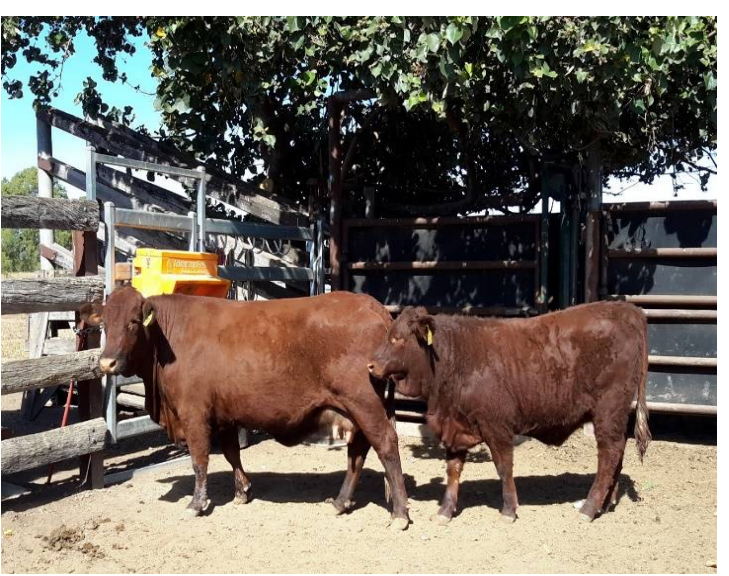
Mitch Warden - Biloela Qld

The beef market is in good times really and the market has held up surprisingly well considering. Obviously, the feedlot market has put a real floor in the yearling market and as I write $3/kg +/- for feedlot steers seems to be the happy place. The steady market this has created has given a lot of faith in the game presently and into the future.