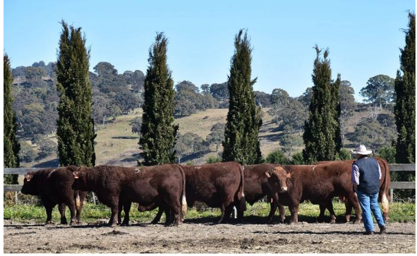
2016 Sale Bulls

Notes: A robust young bull that will cover plenty of cows. This is Jenny F6's second sale bull from two male calves, a medium framed cow with correct udder & teats who has 3 handy daughters in the herd. All her calves show good silky coats which I feel is a sign of easy doing cattle. The Cleaver family – Kundibakh purchased a half brother at last years Open day.