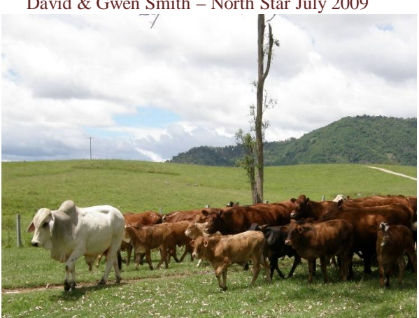
Page Family - Copmanhurst Dec 2011