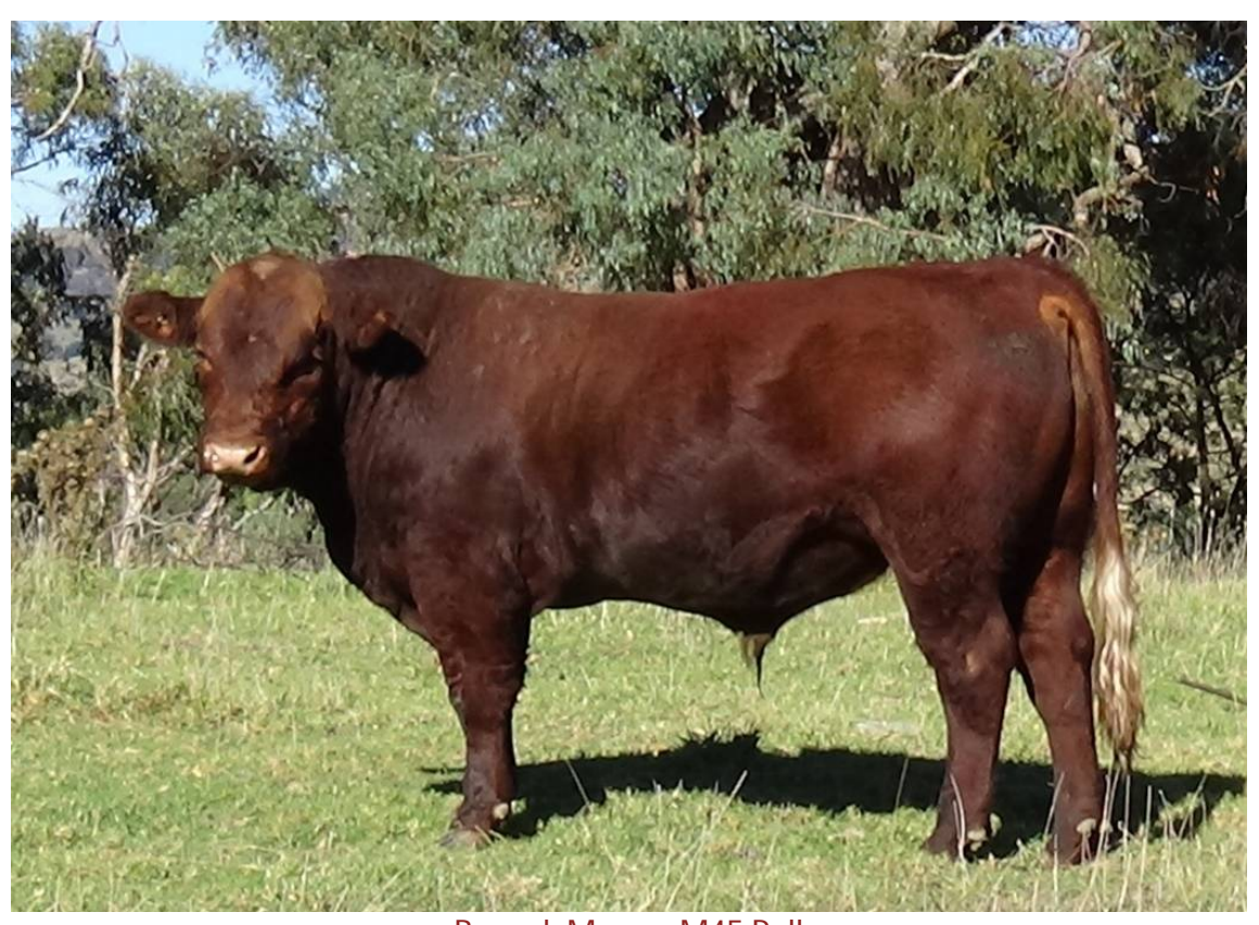
Benoak Marcus M45 Poll

Inspection from 9AM – 4PM Private sale from 10:30am to 11am